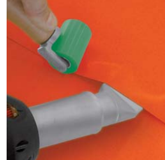
Tarpaulin processing: 40 mm roller